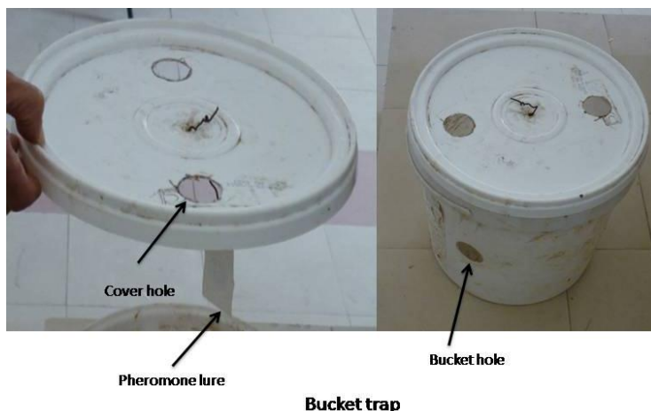
Fig.1. Water plastic bucket trap