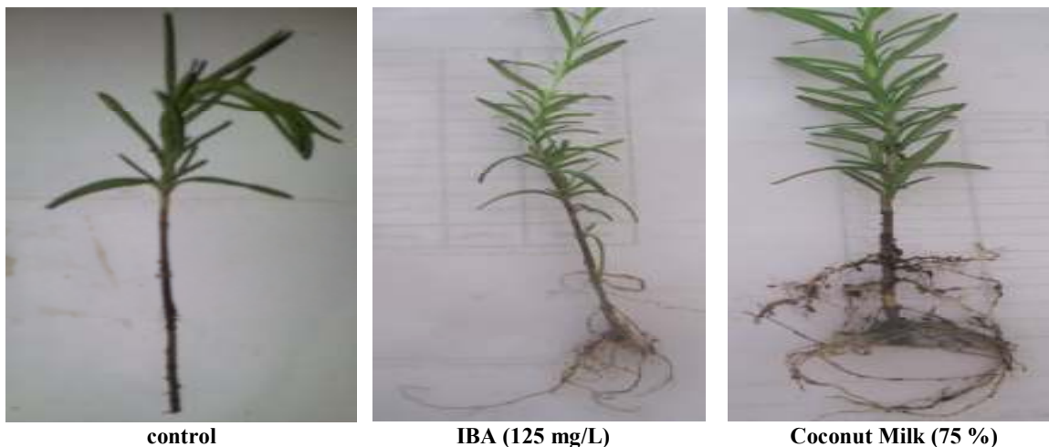
Photo 1. Root length of rosemary ( Rosmarinus officinalis L.) as affected by types and concentrations of control, IBA (125 mg/L) and Coconut Milk (75 %).

These results may be ascribed to coconut milk appears to have growth regulatory properties, e.g., cytokinins, which are a class of phytohormones, which enhancing growth characters and chemical constituents of rosemary. These results came in the similar point of view with those reported by Krajnc et al. , (2013), Shidiki et al. , (2013), Dunsin et al. , (2016), Ibrinke (2016 a and b).