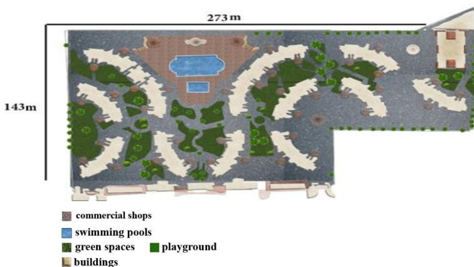
Figure .2. El. Canary Beach resort plan

resort included chalets and swimming pools. Recently, the resort was built beside the gate places for commercial shops but it open yet.