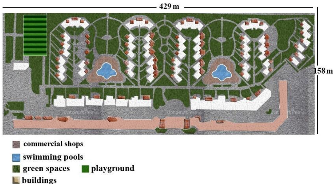
Figure 1. Marhaba resort plan.

2.El. Canary Beach Resort: Like all the resorts, El. Canary Beach resort was located in in Atef El. Sadat street (Tarh El. Baher St.) at El. Monakh district. The