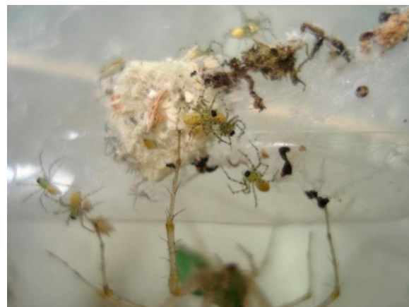
Figure (3): Spiderlings

From the previous egg sacs, 111 individuals hatched and emerged through a round pore at the tip of the egg sac (fig.3), they were reared under laboratory conditions. Only 41 of them reached maturity and completed the life cycle.