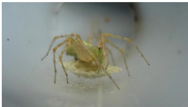
Figure (2): Adult female guarding the egg sac

The incubation period of eggs of P. arabica lasted 31 and 35 days for the first egg sac while the second one, the incubation period lasted after 20 and 25 days respectively.