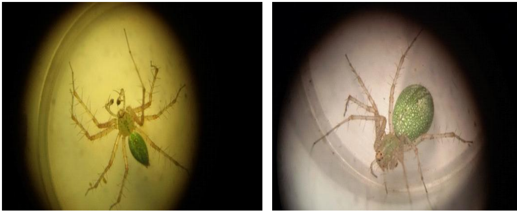
Figure (4): Adult Male and Female